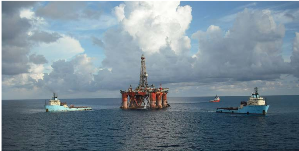
Figure 1: MODU Ocean Patriot being moored on field, taken from FPSO Rubicon Intrepid